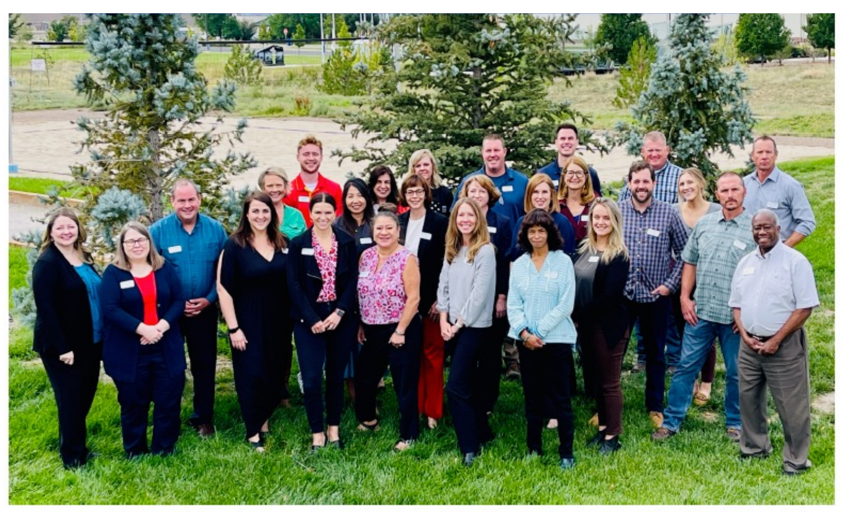
LEAD CLASS OF 2023!